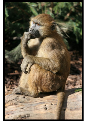
A baboon in the wild.

Baboons are large monkeys that can be found on the ground and in trees in Africa. They spend most of their time on the ground, but they sleep in high places, like trees. Baboons live and travel in very large groups called troops. Each troop has a male leader. This leader helps guard the group. Baboons have different calls they use to talk to each other. If a baboon is scared, their call sounds like a dog bark. A baboon can live to be about 30 years old in the wild.